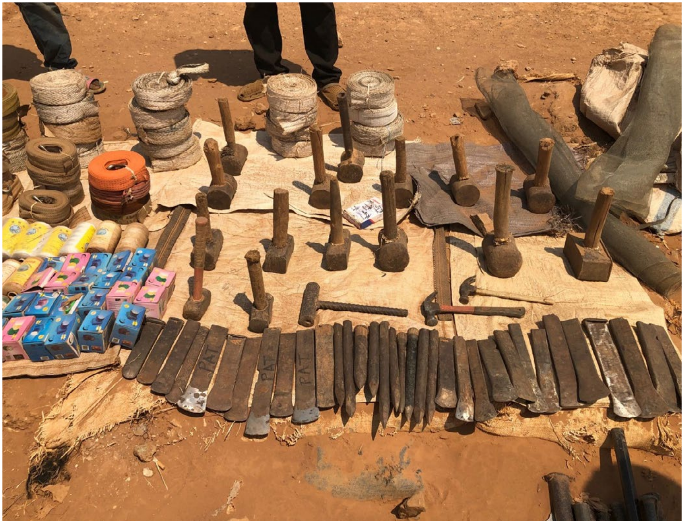
Below: On street market: tools for mining (a complete set costs a maximum of $50)

In light of the rising demand for cobalt, the DRC's unparalleled cobalt resources and its reliance on the cobalt mining industry, solutions to mitigate the human rights risks in the Congolese supply chain need to be developed now.