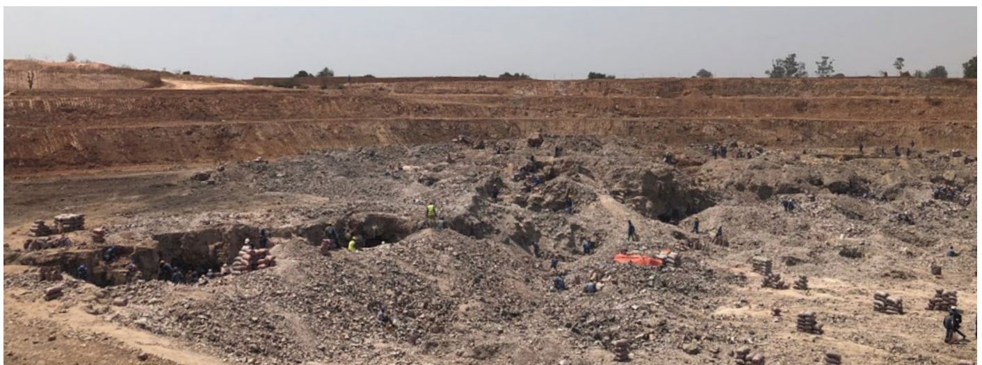
Below: The Mutoshi mining site

While the project's infrastructure, such as overburden removal and PPE distribution, was clearly implemented at the time of the research trip to Mutoshi, other less visible aspects of the project (for example, the extent to which workers trust the grievance channels set up by the cooperative COMIAKOL or the extent of worker satisfaction in general with the work of COMIAKOL) could not be fully assessed. One indicator of success is the amount of turnover and, at Mutoshi, the attrition rate is very low. While alternative sources of livelihood in the Congolese copper belt are very limited, 43 at least some of the miners at Mutoshi have been working on the site for many years. Several of the female workers stated that they liked working at Mutoshi because they felt safe on the site. In addition, child labour on the mining site has been fully eliminated. A first socioeconomic assessment of the Mutoshi community found decreased rates of illness, injury and harassment of female miners. 44 Local critics such as Afrewatch attest to an improved safety situation at Mutoshi, but claim that there are neither economic nor social benefits for workers. 45 Clearly, further independent assessments are needed to comprehensively analyse the improvements in mining conditions delivered by the Mutoshi formalization project.